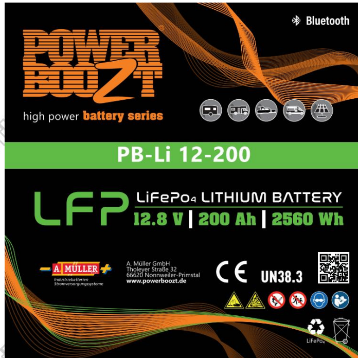
Figure 4 Battery label (电池标签)