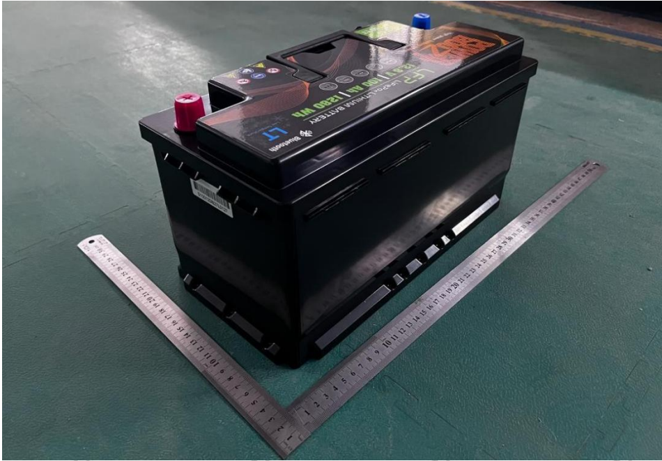
Figure 1 Overall view I of battery (外观图I)