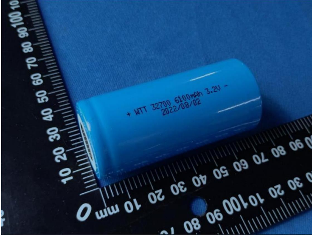
Figure 3 Overall view of cell (电芯图)