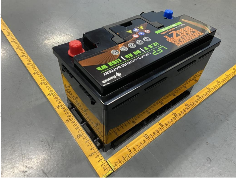
Figure 1 Overall view I of battery (外观图I)