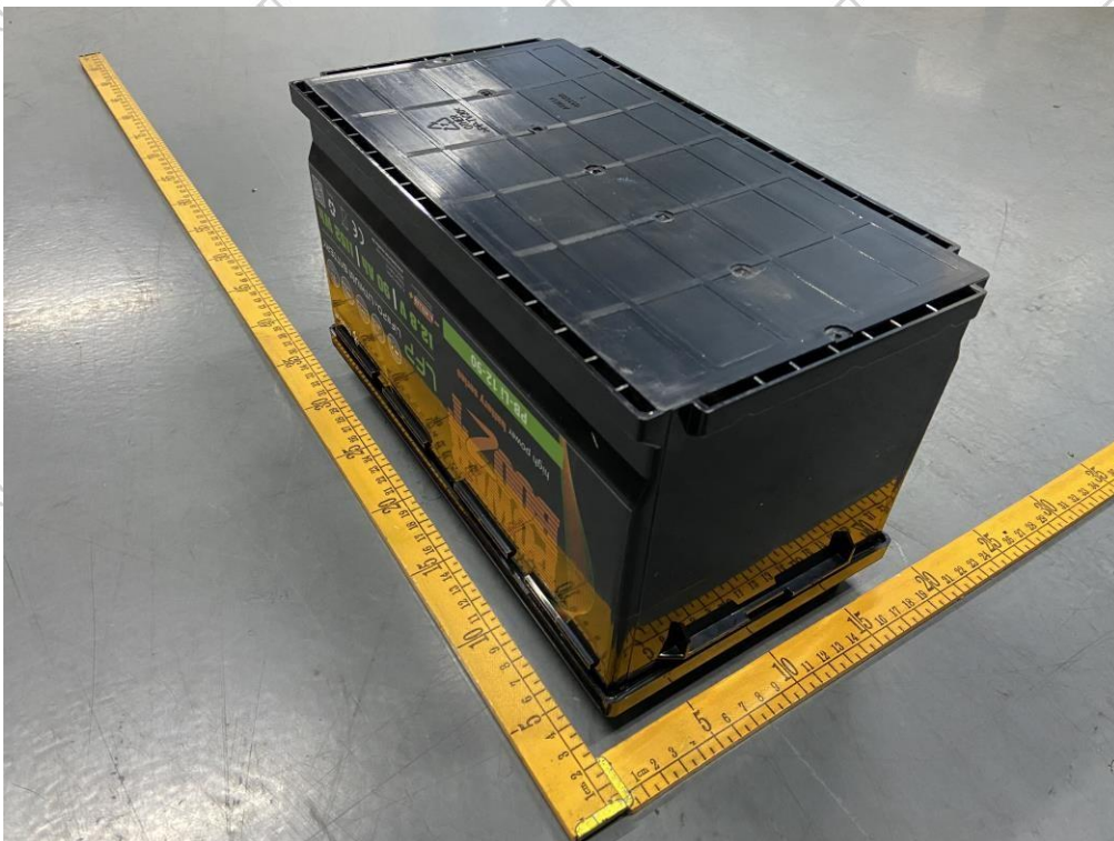
Figure 2 Overall view II of battery (外观图II)