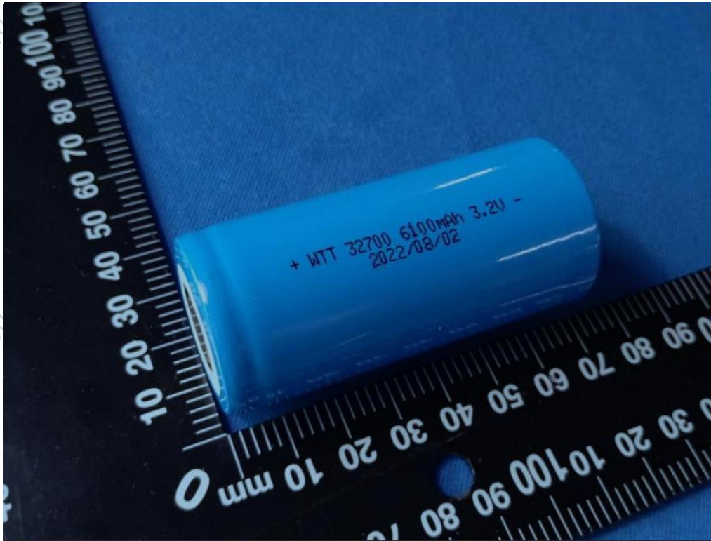
Figure 3 Overall view of cell (电芯图)